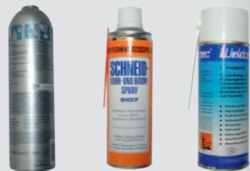
Cans of various types and shapes.

Powerful packing line with a case erector for packing different types of cans. Fast changeovers at high performance. Capable of handling a great variety of secondary packaging such as trays or cases.