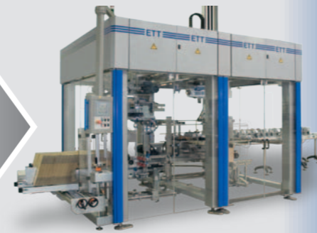
Monoblock Packer MP 888.

Monoblock packer fitted with a gripper head rotating module for flexible handling of bottles and canisters. Fast changeovers to different packing patterns at high performance. Great variety of bottles and canisters.