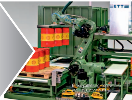
6-axis palletising robot with a vacuum suction plate.

Flexible robotic palletising cell fitted with a universal gripper head for handling canisters, buckets and barrels. Flexible palletisation of different types of containers with short changeover times.