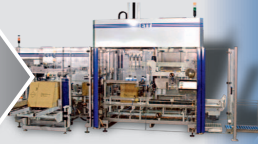
Compact Packer CP 888 with a case erecting module.

Different types of containers with different packing patterns. „Chaotic“ palletisation of different types of containers. Cans of different types and shapes. Packing line for large canisters consisting of a case erector and a compact packer including a case closing module. Every second canister can be rotated by 180° before being loaded into the case to give the cases more stability for palletisation.