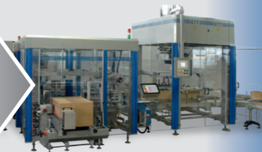
Standard packer P 888 with a case erector.

Powerful packing line with a case erector for packing different types of cans. Fast changeovers at high performance. Capable of handling a great variety of secondary packaging such as trays or cases.