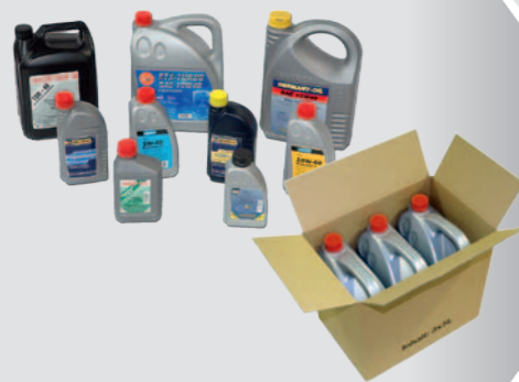
Different types of containers with different packing patterns.

Monoblock packer fitted with a gripper head rotating module for flexible handling of bottles and canisters. Fast changeovers to different packing patterns at high performance. Great variety of bottles and canisters.