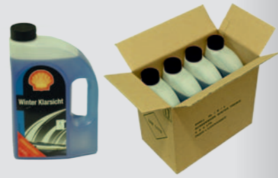
Canisters of 5, 10 or more litres

Different types of containers with different packing patterns. „Chaotic“ palletisation of different types of containers. Cans of different types and shapes. Packing line for large canisters consisting of a case erector and a compact packer including a case closing module. Every second canister can be rotated by 180° before being loaded into the case to give the cases more stability for palletisation.